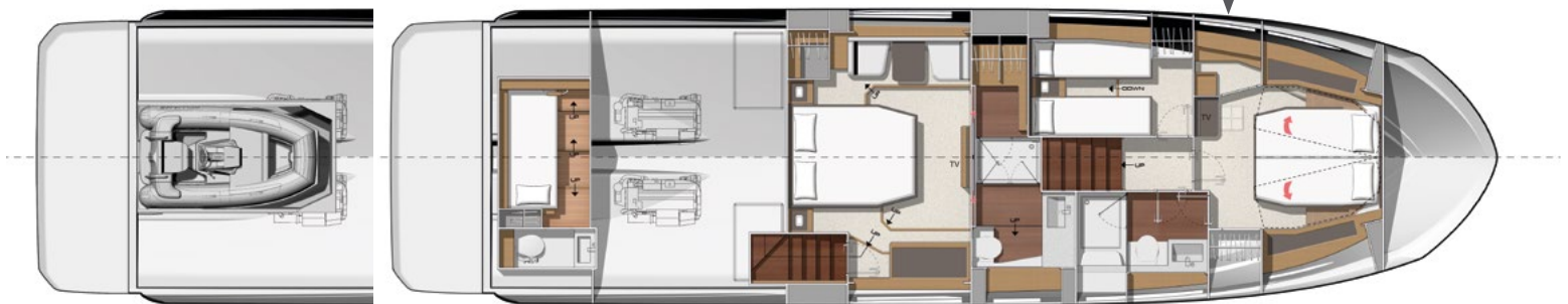
Model available with tender garage or skipper cabin