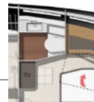
Model available with walk-in closet or bathroom