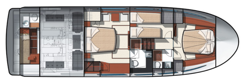
*Model available with tender garage or skipper cabin