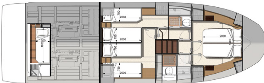
Model available with 3 cabins