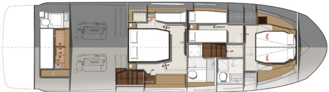
Model available with tender garage or skipper cabin