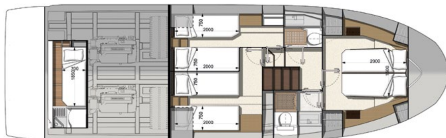
Model available with 2 or 3 staterooms