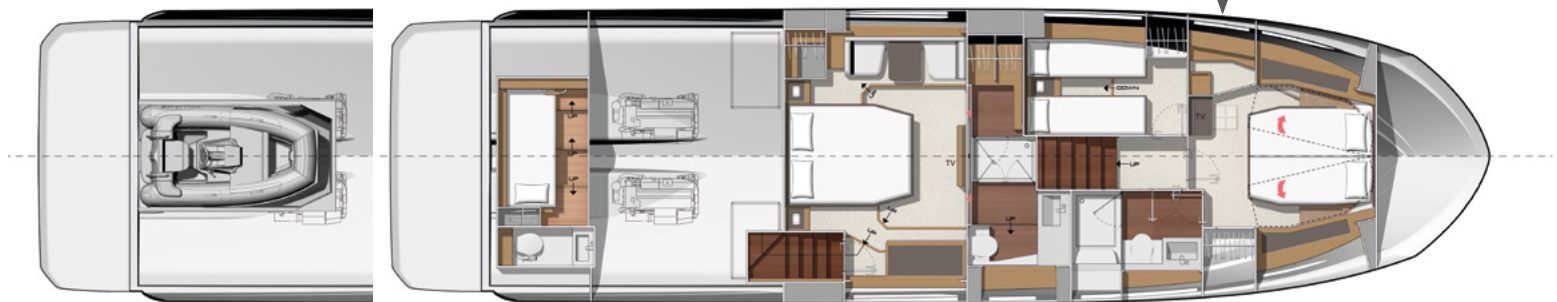
Model available with tender garage or skipper cabin